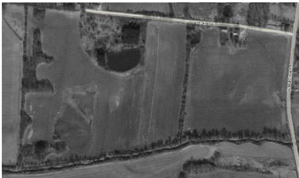
The photo above is an overview from the sat image from the Landsat 7